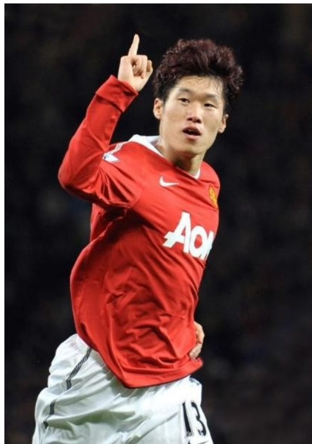
Famous South Korean soccer player Ji Sung Park.

Park is now retired from the Korean national team, but he continues to play for the PSV league. Many people did not want him to retire because he is still young. However, Park said that he may retire from soccer soon so that younger generations have a chance to take his position on the team. Park is an example of why hard work pays off. Even though people criticized him, he kept working hard until his efforts and skills were recognized world wide.