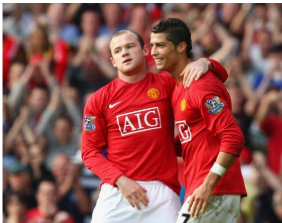
The World Cup is a big event for all soccer players.