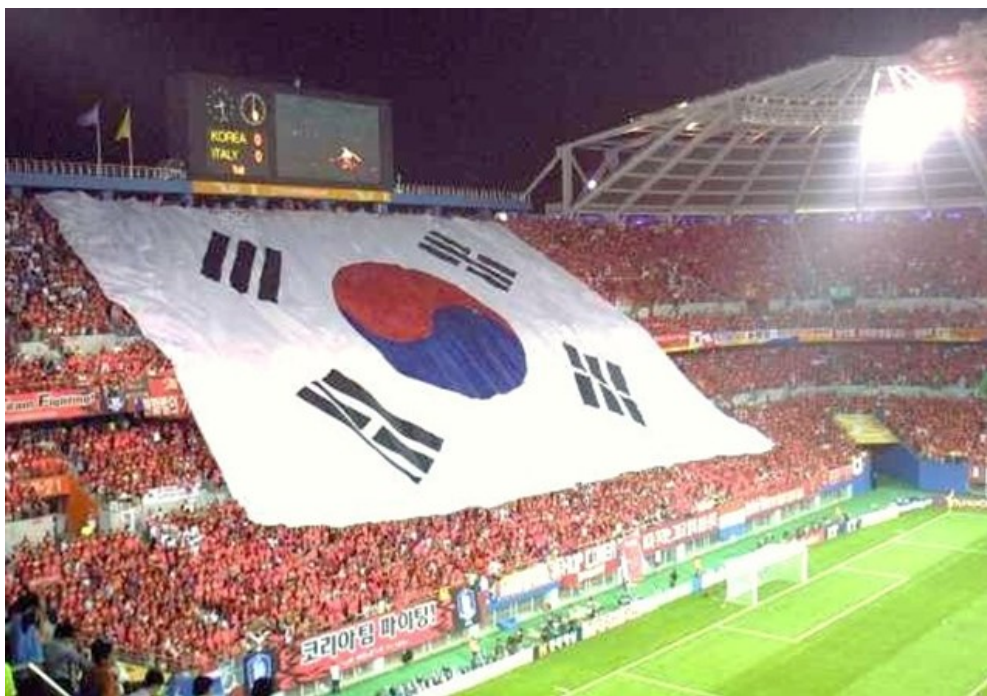
Koreans showing their national pride during the 2002 World Cup.

In the end, the Korean national soccer team moved up to the semifinals. It gave Koreans an incredible feeling of joy. We were thrilled with this news, and we were proud of our players and ourselves. All Koreans, including me, cannot forget the 2002 World Cup.