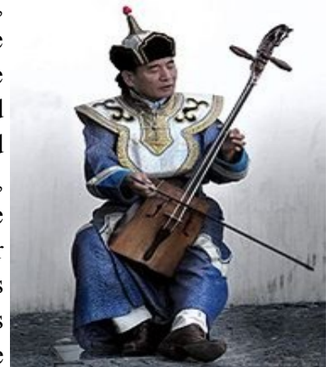
The Mongolian instrument Morin Khuur.

The Morin Khuur is one of the main traditional instruments in Mongolia, and the one most associated with Mongolian traditions and art. Morin Khuur means horse fiddle in English. It produces a very unique and melodious sound, which is often described as great and powerful, like a horse neighing, or like a breeze in the grasslands. The instrument is made completely out of wood, and the strings are made out of horse tail hairs. When a person plays the Morin Khuur, it is held upright with the sound box in between the musician's legs. Mongol people love the Morin Khuur in the same way they love their horse. When Mongolians were living as a nomadic nation, the horse was their only transportation, like a car, and functioned truly as man's best friend. Many songs and poems were written praising the horse. The horse head fiddle is even mentioned in historical documents created during the Mongol Empire. There are several stories of why and how the Morin Khuur was first created, but they all include some variation about the love between a man and a dead horse. Mongolian art, and even forms of blessings, are inseparable with the music of the Morin Khuur and the instrument has changed very little since its origin. Nowadays, the Morin Khuur is one of the greatest instruments of the world, and you can hear