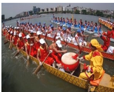
Dragon Boat Competition

around and eat delicious moon cakes. It is a peaceful holiday to enjoy happiness with family, and to watch the bright moon in the sky. During the Dragon Boat Festival, the boat crew will dress up and race their boats in a competition. It is also a traditional festival that includes eating rice dumplings and drinking Realgar wine. October 10 th is Taiwan's national holiday called Double Ten. The celebration starts with the flag being raised in front of the Presidential Office Building. The design of the flag is a blue sky with a white sun. The president will lead thousands of people in singing the national anthem to begin the holiday. The biggest holiday