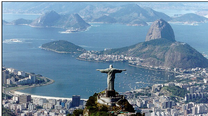
The famous statue called "Cristo Redentor" (Christ the Redeemer).