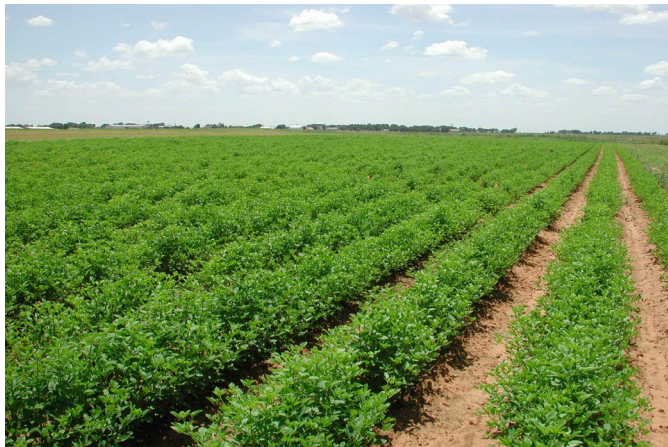
The fresh land and a nice plantation in Benin.

Benin is known for its production of palm oil and cotton. The palm oil industry is an industry that creates lots of jobs and generates income in rural areas in southern Benin. SNV Benin (a non-profit international organization) wants to support the ambitions of the Benin government to increase production of palm oil from 107,169 pounds a year in 2000 to over 1,071,691 pounds a year with the modernization of palm oil village plantations. Cotton is the most popular and profitable crop that Benin grows, and it drives economic and social development, particularly in rural areas. Cotton production involves more than 325,000 farms, representing 3 million people, which is nearly 50% of the population. Cotton makes up 80% of export earnings. SNV Benin is part of a system that encourages and also has a very sustainable improvements in the income and living conditions of cotton farmers. The organization works by helping union members more efficiently produce cotton, better manage operations, and better defend the interests of their members, including women and small producers.