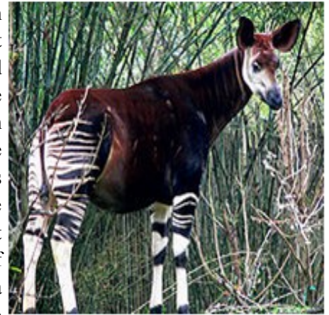
This is a picture of the okapi, found in the DRC.

The Democratic Republic of the Congo, or DRC, is located in the center of Africa. The DRC is known for its Equatorial Forest and the Congo River, which is the third largest river in the world and the second most powerful after the Amazon River. In the DRC, there are multiple touristic attractions. The DRC has rich fauna and flora, and you can enjoy nature's gifts by seeing some rare animals like the okapi or the bonobo. A bonobo is an ape which looks like a chimpanzee, and is found only in DRC. You can also visit one of the nine national parks and some other natural places like the Botanic Garden of Kisantu, located in the southwest part of the capital city Kinshasa. Here you can also find other protected species of plants, trees, and flowers. You can also contemplate visiting Zongo Falls, and Lola Ya Bonobo, which means "the paradise of bonobos" in Lingala, and is also located in Kinshasa.