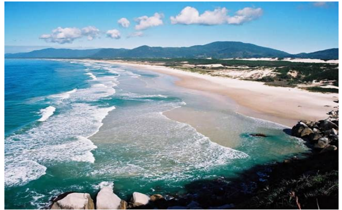
One of Brazil's many beautiful beaches.

bustling nightlife. In Sao Paulo, there are all different kinds of entertainment options such as theaters, nightclubs, restaurants, parks, and malls. Sao Paulo is "the city that does not stop." If you like to hang out with friends, meet new people, and listen to good music, this city can offer you all this from Sunday to Sunday. Want to know more about places to visit in Brazil? Then make sure you read the article in this edition about Rio, the "Postcard of Brazil."