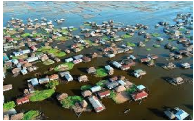
Ganvie is a special place built on a lake.

average population that leads a life very adapted to its location. It is written in its history that people who live in Ganvie are descendants from people who, during the time of slavery, refused to be slaves, so they were obliged to create a new life somewhere they could be safe. They sacrificed much because it was not easy to build houses on the lake, and many people died while they were building this city. Nowadays, it is very nice to live there, even if there are some social and economic problems. There you can find everything that you see in a normal city such as markets, hotels, schools, etc. However, the only transportation available is canoes or ships. Everyone there knows how to swim from birth.