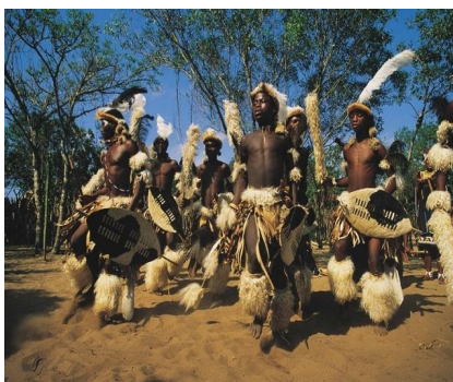
People from Zambia enjoying Zambian dance.

Zambia has a lot of tourist attractions with people coming from all around the world to see the beautiful landscape and the rich culture. In addition, the people are very hospitable. The best time to visit Zambia is from August to November, when it is warm and not humid. In Zambia, there are 17 waterfalls, chimp sanctuaries where they keep chimpanzees, 19 national parks, and 34 amusement parks.