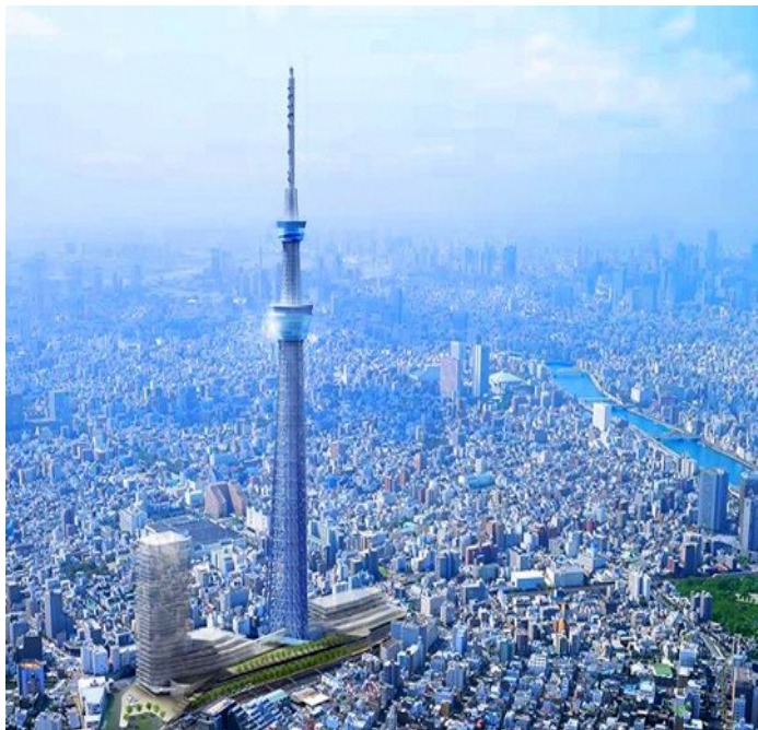
The highest tower in the world: Sky Tree.